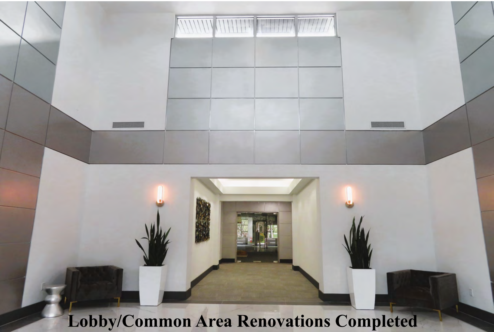
Lobby/Common Area Renovations Completed

3040 Universal Boulevard, Weston, FL 33331