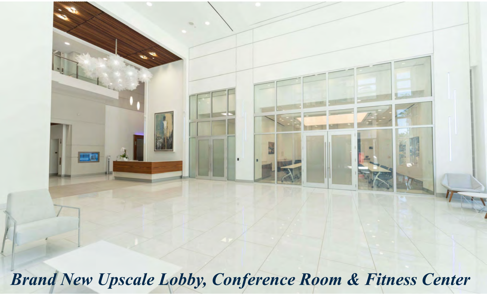
Brand New Upscale Lobby, Conference Room & Fitness Center