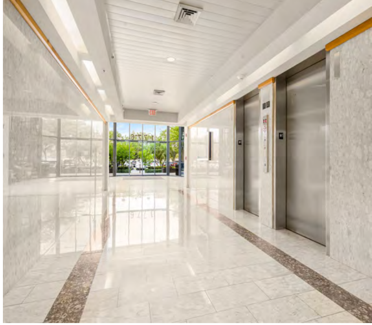
1776 North Pine Island Road, Plantation, FL 33322